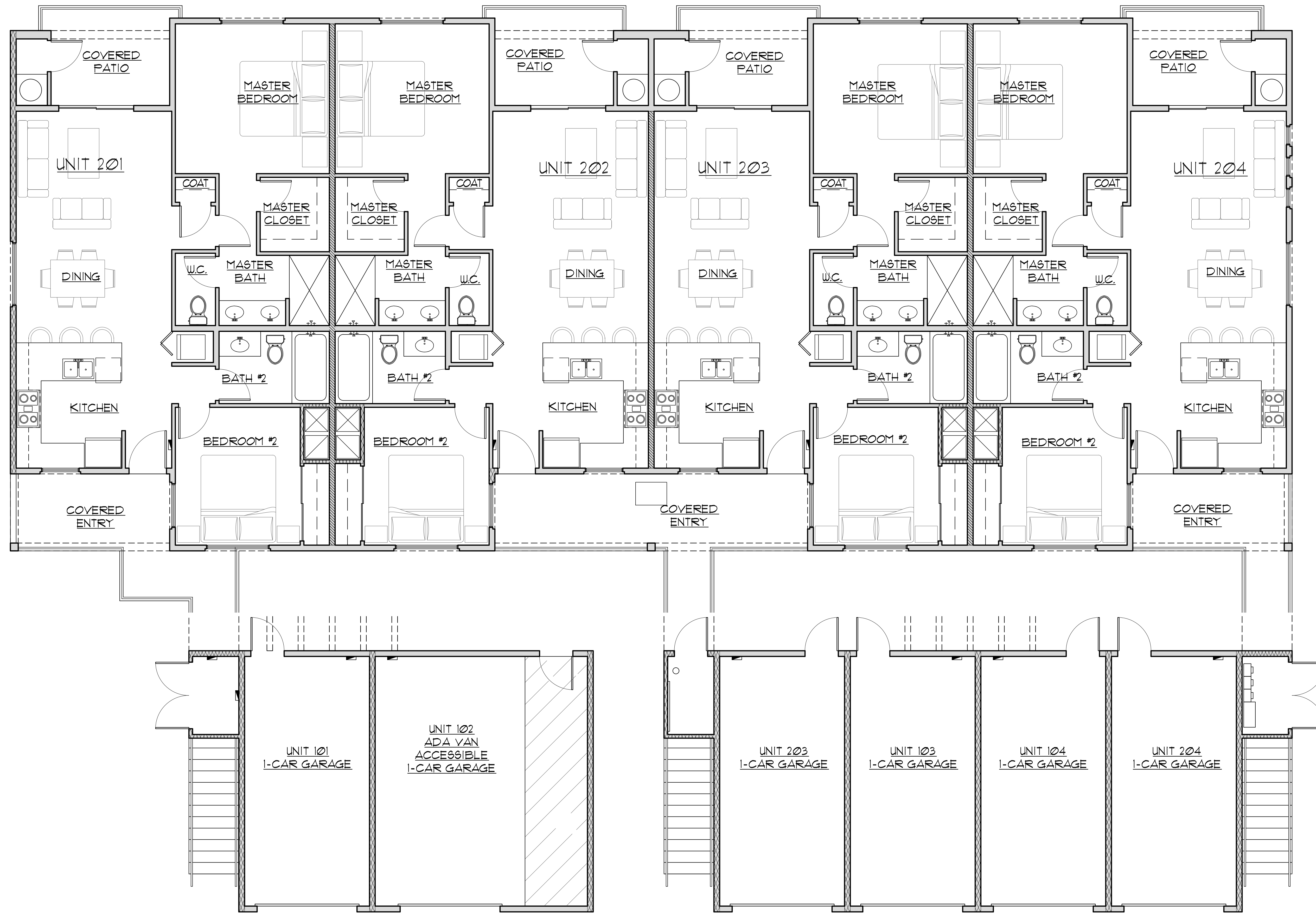
SOUTH BUILDING 2ND FLOOR PLAN SCALE: 1/4"=1'-0"